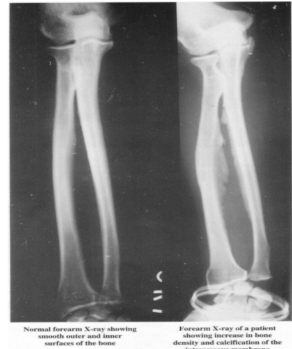
Photo: Forearm X-ray of patient showing increase in bone density and calcification of the interosseous membrane due to over-exposure of fluoride. Journal of the International Society for Fluoride Research: http://www.fluorideresearch.org/forearm/files/forearm.pdf

"increasing numbers of people with carpal-tunnel syndrome, arthritic-like pains, osteoporosis may be due to the mass fluoridation of drinking water.